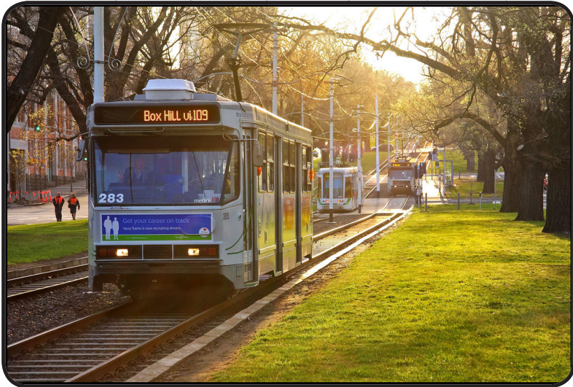
Melbourne first introduced trams in 1885 and is now home to the world's most extensive tram system, with a total track length of 245 kilometres of track and over 1800 stops. Despite declining ridership in the 1970s, Melbourne retained and modernized their tram network while other many cities were removing theirs.