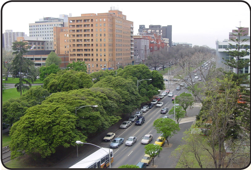
Victoria Parade is the major east-west thoroughfare connecting several central Melbourne neighbourhoods. Running seven kilometres with a reservation for light rail in the centre, it acquired its name for its former use as a parade ground.