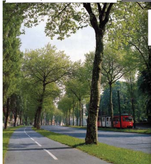
Le Grand Boulevard à Mouvaux

Small setbacks, designated crosswalks, bike lanes, and planted medians make the boulevard pedestrian friendly.